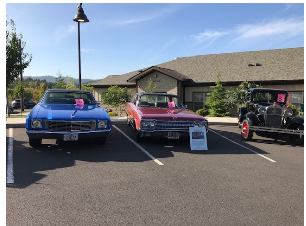
Willamette Springs BBQ & Car Show