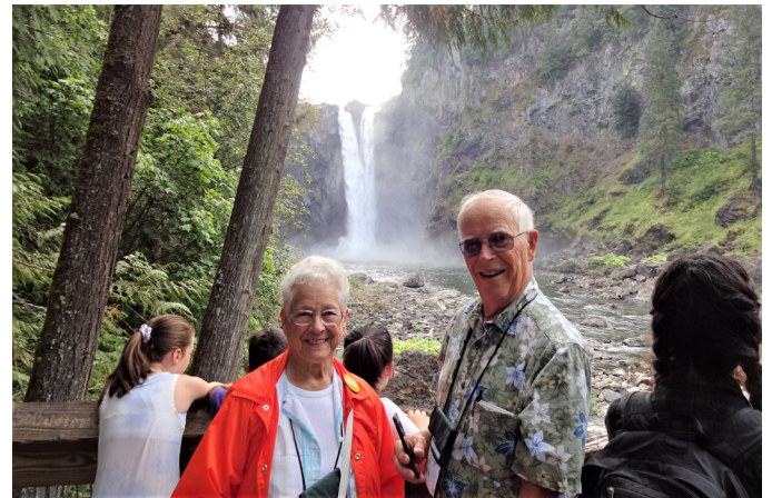
Bellvue, Washington (above)